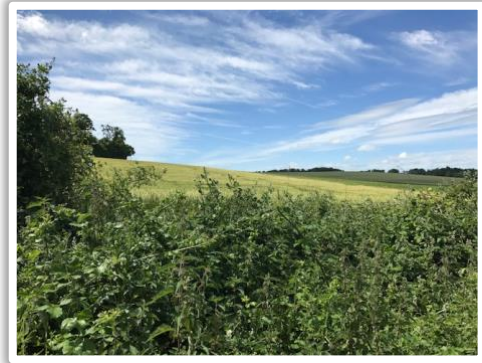
Get fresh air daily if you can