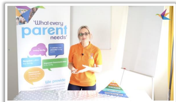
FREE online parenting programmes