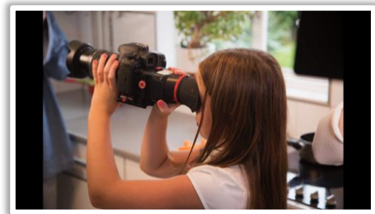
What's the NEED behind the behaviour?